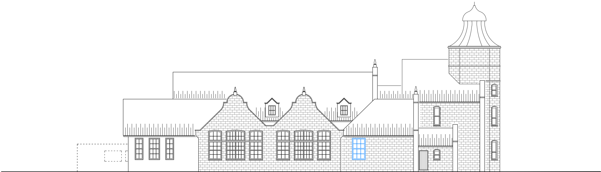
SIDE ELEVATION (A) (NO:01 MAIN BUILDING)